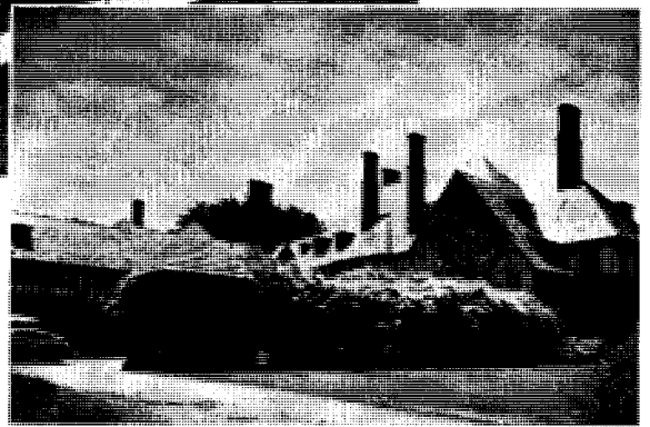
Probably the most recent big company to take the step is Mathieson. Main building on a 350-acre site near Shawan, Md., which Mathieson plans to turn into a farm-laboratory