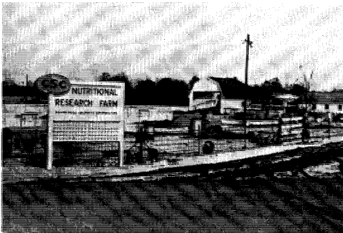
One of two farm plots Commercial Solvents uses for research aimed at producing bigger litters and speeding up pig growth. Another tract is arranged for nutritional studies

Careful mixing of feed formulas is important on experimental farms. At Dow's farm, methionine is added to chicken feed to show effects of the amino acid